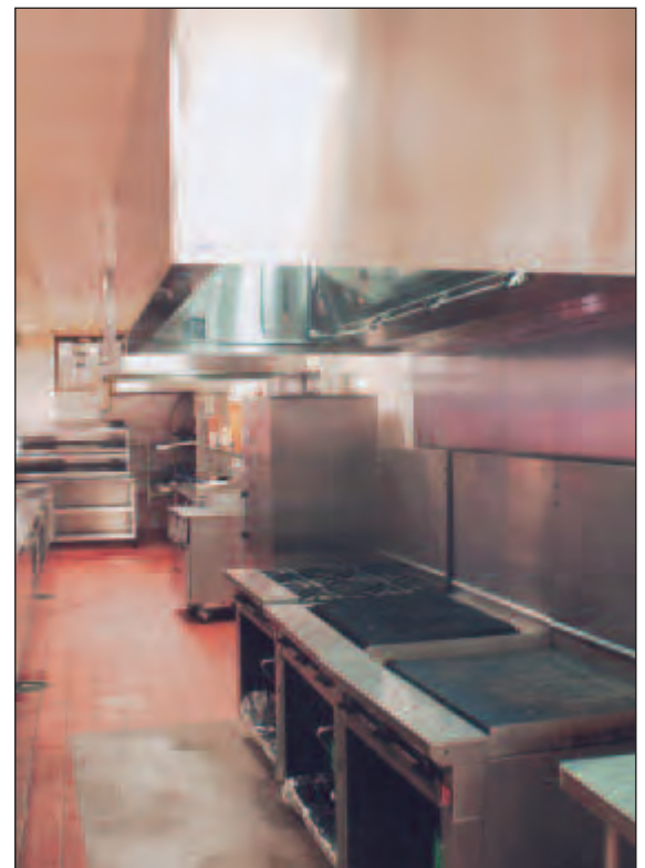
Fifteen new hoods were installed.