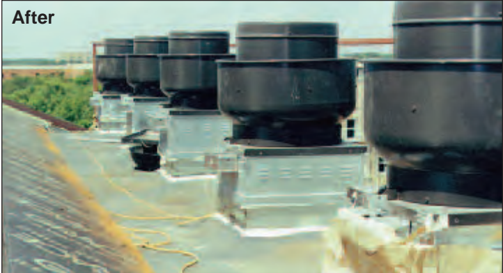
Three large exhaust fans were replaced with multiple smaller fans to serve several smaller cooking and serving stations. This allowed more efficient use, but required multiple duct installations and penetration through already congested areas.