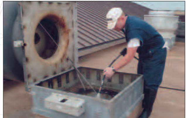
Spraying from roof down, no leaks below.