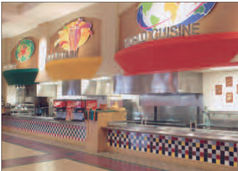
Sbisa offers a wide variety of cuisine.

The key renovation of the kitchen and foodservice area demanded attention from campus administrators, engineers, maintenance personnel, architects, and contractors. A master plan began in 1997, with construction starting in December, 1999.