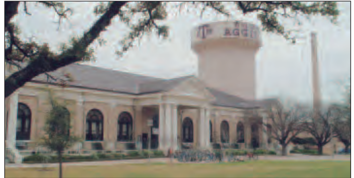
Texas A&M University's Sbisa Dining Hall.

Sbisa Dining hall is a 94-year-old building originally designed to house the university's Corp. Cadets in its military school days. Serving its first meal in 1913, the 100,000 square foot building is the oldest dining hall on that campus, and was the only building large enough to serve as a meeting place for the Corp. Cadets. Years of use and remodeling, the last remodel being performed in the 1970's, had led to deterioration and architectural confusion. Plans for renovation focused on "display cooking" freshly made items in front of customers, branded food concepts, and flexibility to change concepts to meet future student demands without large renovation. The plans also called for bringing a more traditional look back to the building, including restoring the former main entrance at the end of the historic "Military Walk". The entrance restoration includes the Texas A&M official seal, laser cut from six different woods and inlaid into the wooden floor.