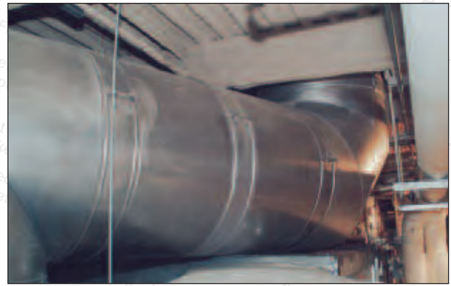
Metal-Fab Series 4G Grease Duct is leak-free.

"Round duct washes easier and doesn't stick as much, and the stainless steel is a factor. This system cleans real nice and it's definitely easier than square," said Sullivan. "Sbisa takes about one day to clean. Other equivalent jobs with square duct take about two days, this round duct takes about half the time to clean. Also, this system has water wash hoods, and when you use a non-stainless duct with this type hood you normally see the bottom of the duct rusted out."