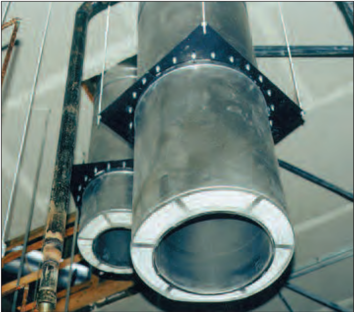
Requiring no chase and no clearance to combustibles, Metal-Fab’s Series 4G Grease Duct allowed installation in otherwise impossible areas.

Working with Hunton Specialty Products, the Metal-Fab representative agency in Houston, the engineers specified Metal-Fab’s Series 4G Grease Duct. The grease duct is a round, insulated grease duct with an integral chase that allows a zero clearance to combustibles and required no welding. Series 4G is a proven alternative to welded duct. No other grease ducting system has undergone the extensive independent testing conducted on Metal-Fab Series 4G. Portions of UL 103, UL 1978, ASTM E814, and ASTM E119 were combined to determine structural integrity, clearances to combustibles, rated partition penetrations and overall safety. The test data was submitted to BOCA, ICBO, and SBCCI, and all three code agencies have recognized Metal-Fab Series 4G as an alternative grease ducting system; the only factory-built integral chase/zero clearance system to be recognized by all three agencies.